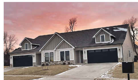
Neighborhood 19 at Brio