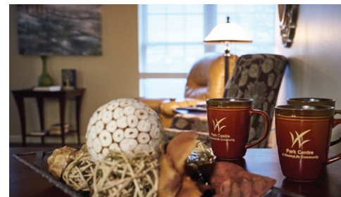
Household renovation at Park Centre

The program also assures residents that if they need care at some point, they will be able to access it immediately from WesleyLife at no cost other than their membership and monthly fees.