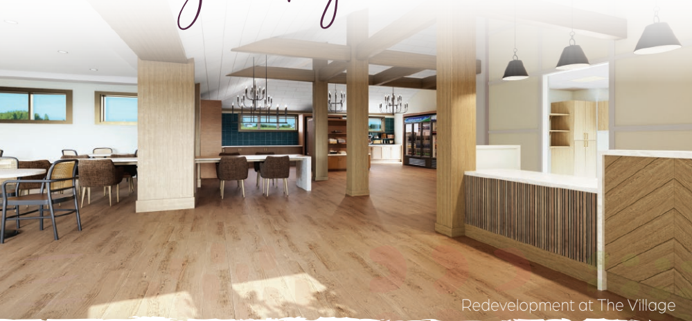
Redevelopment at The Village

As we move through our 78th year, WesleyLife continues to illustrate our reach-broadening mindset with a period of unprecedented growth and development!