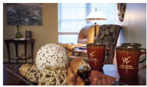
Household renovation at Park Centre

The program also assures residents that if they need care at some point, they will be able to access it immediately from WesleyLife at no cost other than their membership and monthly fees.