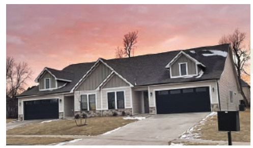
Neighborhood 19 at Brio